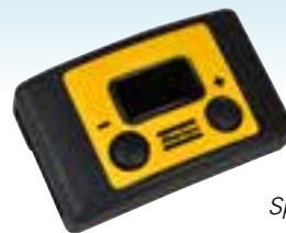
Speed setting unit

The tool shuts off automatically at the preset torque. If the tightening is OK, the LED on the upper part of the tool shows a green light that is visible from a wide angle. If the tightening result is not OK, a red light will alert you. The LED also tells you the status of the battery and gives a low battery warning. A buzzer can be activated to make the feedback even more clear. These features verify your tightening results and give you peace of mind.