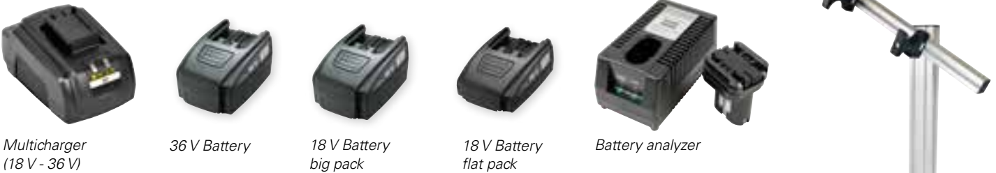
Multicharger (18 V - 36 V)