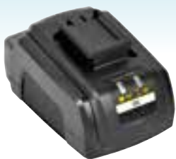
Multicharger (Fits all Atlas Copco batteries)