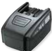
Work for twice as long with the big pack battery.