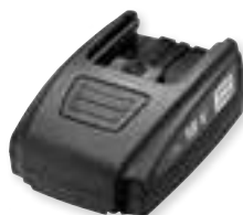
Low weight with flat pack battery.